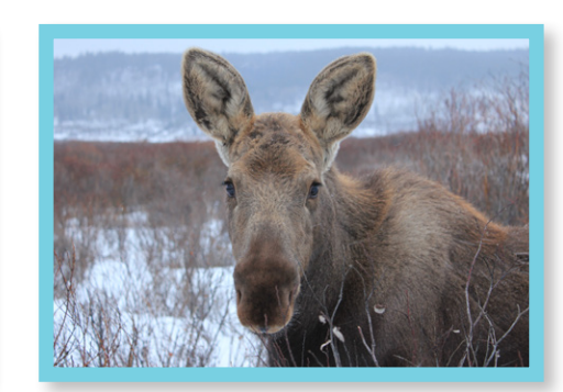
Our second moose patient admitted from the Grand Prairie area, shortly after release.