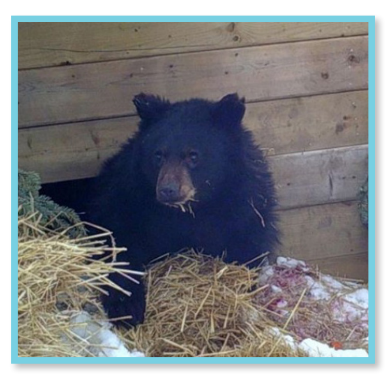
AIWC's second black bear cub patient of 2019 outside his den.

Though initially cared for in adjacent enclosures, starting in April, AIWC staff began slowly introducing the cubs to one another; patients tend to recover much quicker and experience less stress with company of their own species. So far, AIWC is pleased to report the introductions have gone well. Both bear patients have gained a significant amount of weight, are in good health, and are due to be released later this spring.