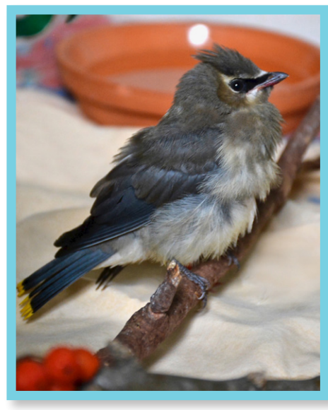
One of AIWC's juvenile cedar waxwing patients

And did you know... a group of cedar waxwings can be called a "museum" or an "ear-full". If you're lucky enough to encounter a large group in the wild, you'll soon learn where that second name comes from!