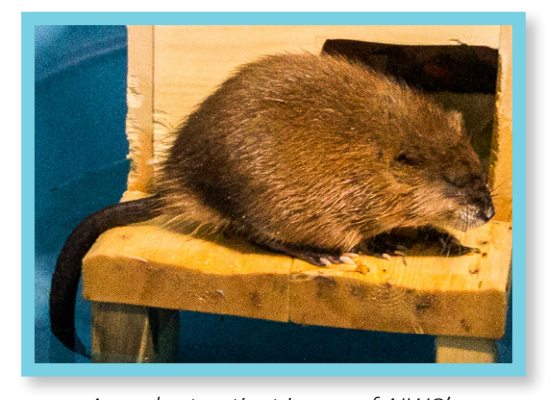
A muskrat patient in one of AIWC's

Thanks to the community, both patients are now enjoying the remainder of the winter in indoor pool enclosures, and will stay in supportive care until being released in spring at suitable new locations.