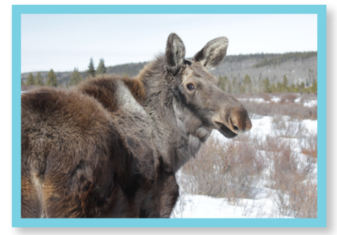
The first moose calf patient with one last look back before returning to her life in the wild.

We could not carry out our mission without you, and these calves are an excellent example of how you are making a difference to the lives of wildlife in need. Thank you!