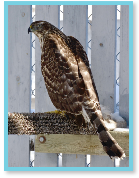
Northern goshawk in outdoor enclosure

It is thanks to the support of people like you that AIWC is able to care for patients like this goshawk and give them a second chance at life in the wild!