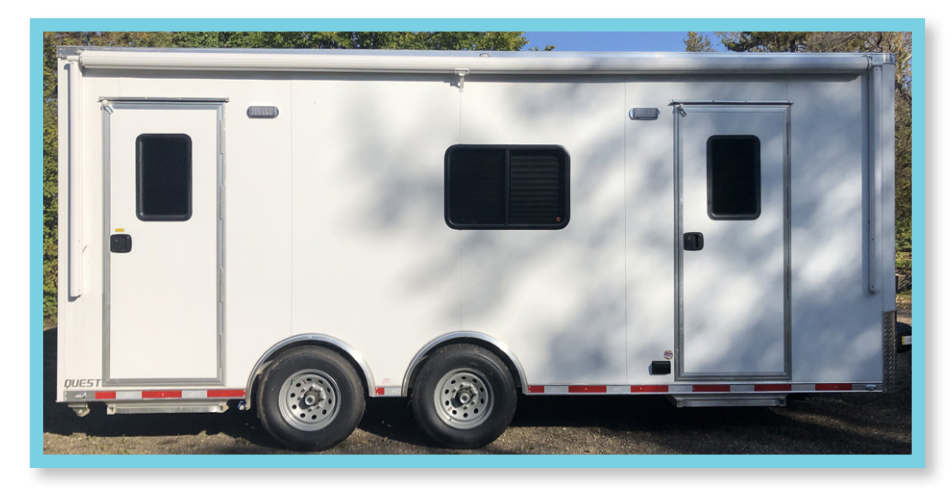
Wildlife emergency response unit mobile trailer

In 2019, the final phase of this partnership got underway with the support of Inter Pipeline Ltd. and the Government of Alberta; through the Community Facility Enhancement Program, we were able to build a Wildlife Emergency Response Unit.