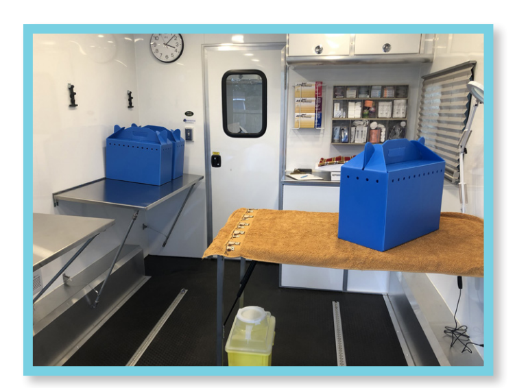
Inside view of the mobile trailer

In light of the COVID-19 pandemic, we have had to postpone our plan to have the trailer available for public viewing at our 4th Annual Garage Sale event initially scheduled for May. We will keep you updated if and when a new date is decided, but in the meantime, we hope you enjoy these photos.