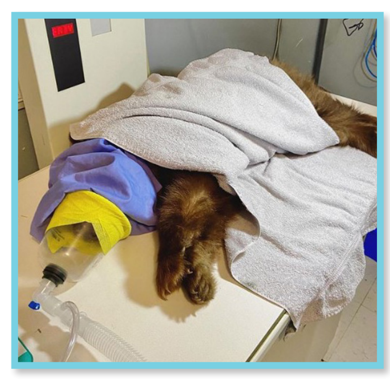
AIWC staff preparing to examine our first bear cub patient admitted in 2020.