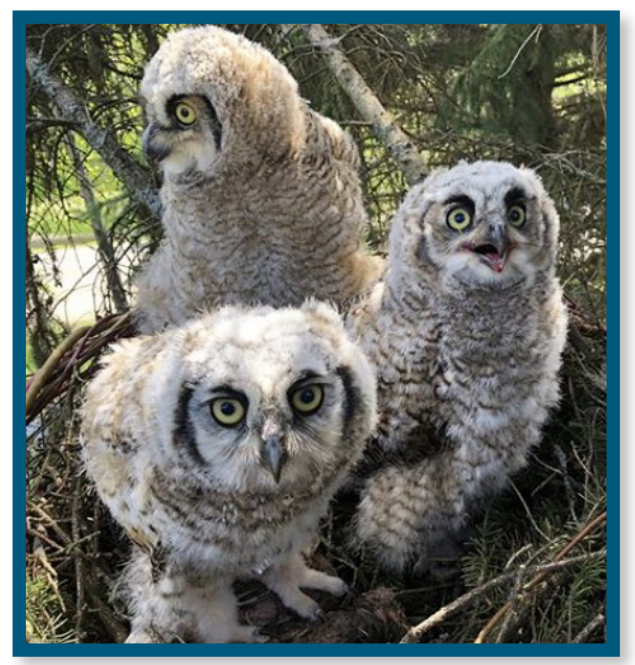
Great horned owlet with her new foster siblings