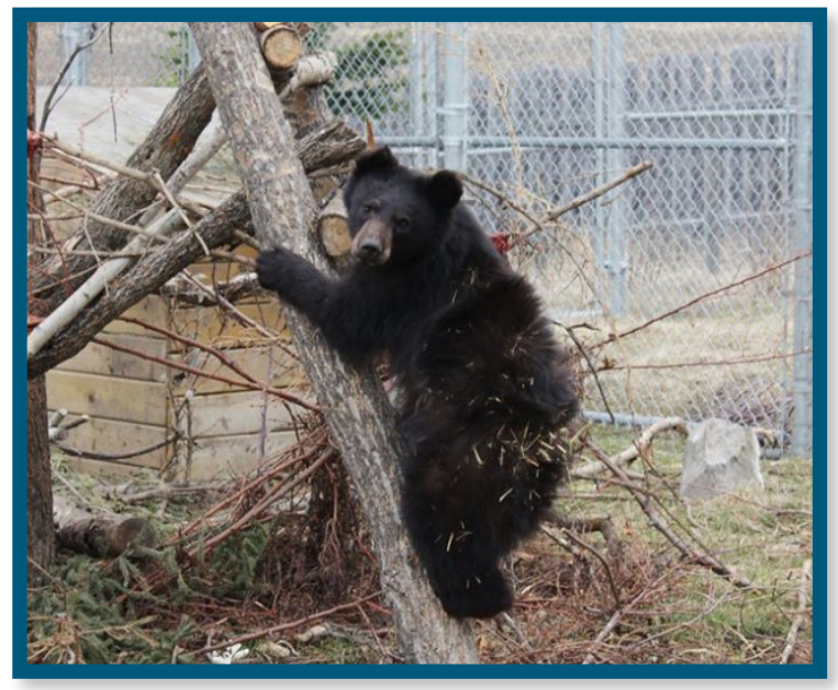
Male black bear cub in outdoor enclosure

It is very important that bear cubs are rehabilitated properly while in care, which is why our staff ensure very limited human interaction, and provide the bears