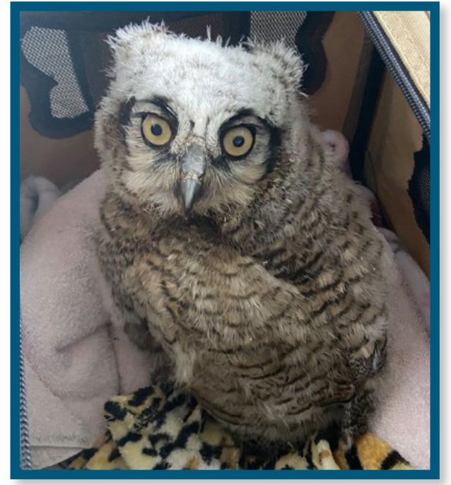
Great horned owlet patient

Though we are lucky this patient's story has a happy ending, that is not always the case, and this serves as a reminder to everyone that secondary poisoning from rodenticide is a very real risk to our pets and wildlife and we encourage everyone to seek out safer alternatives. Please never hesitate to contact our Wildlife Hotline for information on how to peacefully coexist with all of our wild neighbours – big and small.