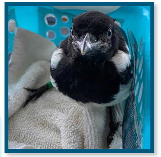
Juvenile Black-billed Magpie

Sponsoring one of AIWC's magpie patients, or any other current AIWC patient you see here or on social media, helps with the costs directly associated with their care and rehabilitation. As part of your sponsorship, you will receive a certificate, a glossy 8×10 photograph of your patient, and a tax receipt for the full amount of the sponsorship. Thank you for helping us to keep them forever wild!