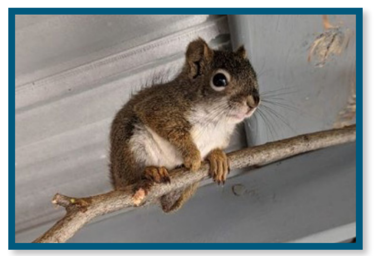
Juvenile red squirrel patient in outdoor enclosure

One of our squirrel patients came to us this spring from Black Diamond and was found to be suffering from minor wounds following a bird attack. As luck would have it, we received a second squirrel patient on the same day: a suspected orphan found hiding underneath a car in SW Calgary. Underweight and dehydrated, the