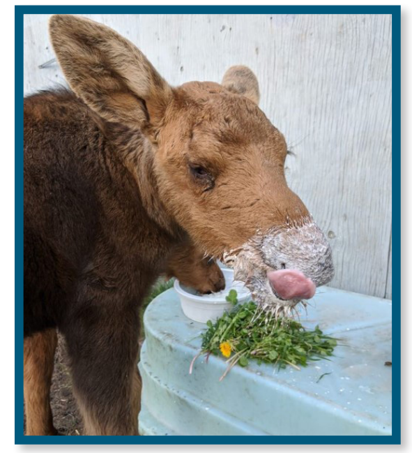
One of the moose calf twins in care, enjoying her formula

So far, we have seen a 27% increase in the number of animals admitted to AIWC, compared to the same time in 2019. We are attributing the increase to more people spending time outside in nature, but we also know that urban expansion and changes to the environment impact our wild peighbours more and more