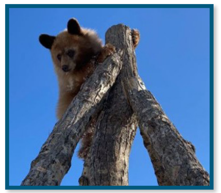
Cinnamon-coloured female black bear climbing

with proper den materials, places where they can climb and explore, and necessary foods like berries, eggs and small amounts of meat. Our two bear cubs were slowly introduced to one another during their rehabilitation as well, which can help to reduce stress and improve the recovery process.