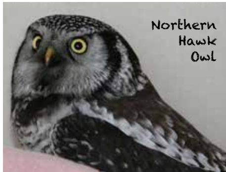
Northern Hawk Owl