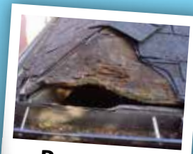
Raccoons in the attic?