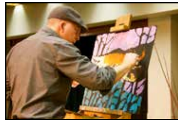
luminous ✨ Suncor Energy Ivanhoe Cambridge Inc. Purple Orchid Flowers Bow Point Nursery