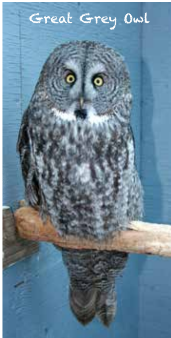
Great Grey Owl