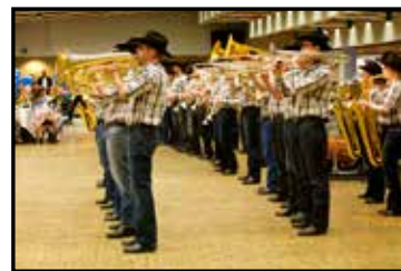
A huge thank you to everyone who supported this event!

helping AIWC continue the endless rescue and rehabilitation of Alberta's wild lives! All funds raised go directly to the rescue and treatment of injured and/or orphaned native wildlife.