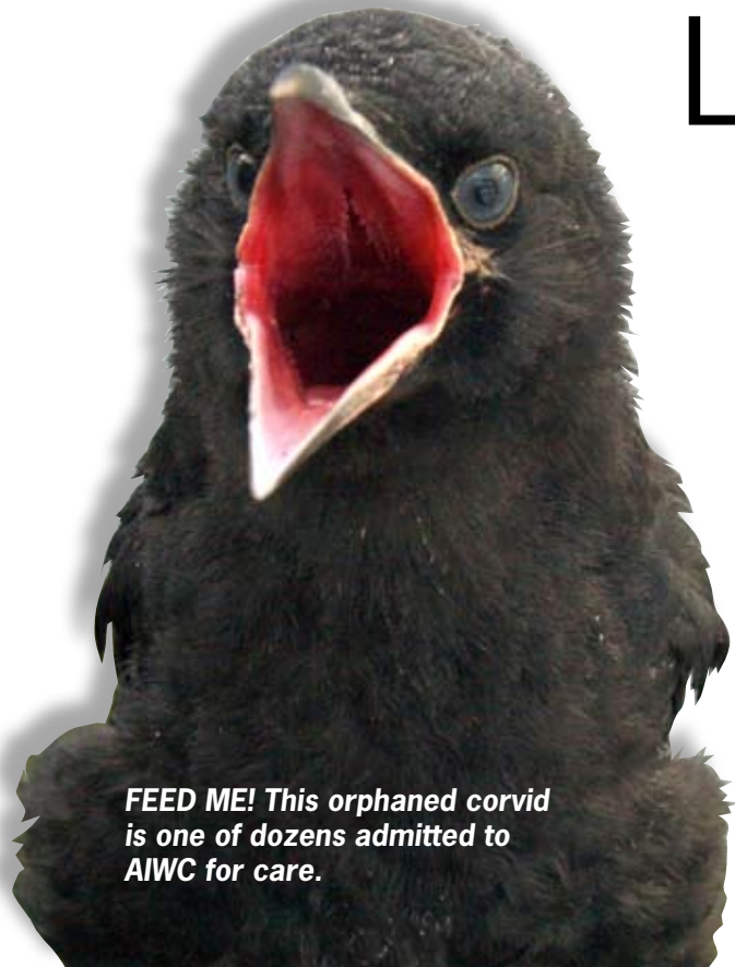
FEED ME! This orphaned corvid is one of dozens admitted to AIWC for care.

It does not matter what time, place, or species, there is always a person out there, with a genuine love for animals, who will put on the proverbial flashing lights and sirens to rescue injured or orphaned wildlife. "It" is a Life, after all!