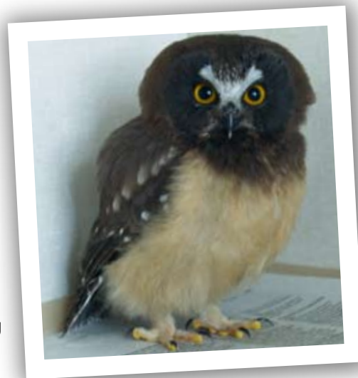
One of Alberta's smallest owls, the saw-whet, recuperating after flying into a window.

More information about the individual members is posted on www.aiwc.ca .