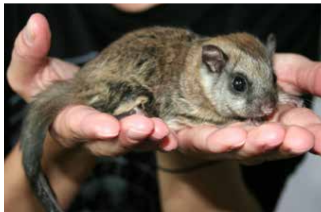
Flying squirrels are found throughout the boreal forests of Alberta. However, having a flying squirrel admitted to AIWC is a curious first!

Logging (clear-cutting in particular) reduces available habitat and nesting sites, creating large open spaces too