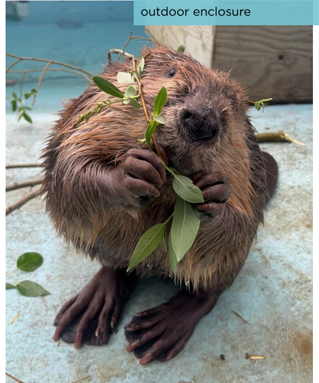
Beaver kit in care in her outdoor enclosure

Caring for an animal for two years is costly. To sponsor this adorable beaver in her final days with AIWC, go to https://aiwc.shop/collections/sponsor-a-patient/products/north-american-beaver .