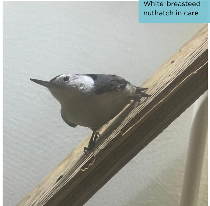
White-breasted nuthatch in care