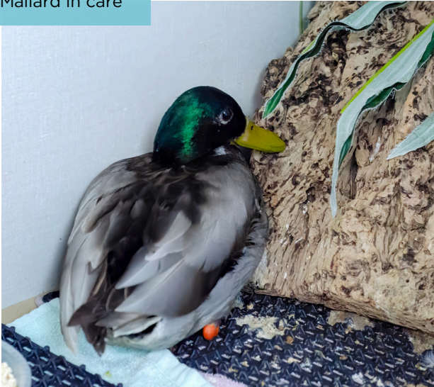
Mallard in care

During a cold snap in Calgary, this mallard duck patient was brought into our care (on February 24, 2026). On the initial exam, he was cold, quite thin, missing his tail feathers, and had some discoloration on his feet and other symptoms, which pointed towards frostbite. We immediately started him on pain medications, as well as a medication to improve the blood flow to his feet to help with healing. Luckily, his injuries were not necrotic, and the damaged skin on his feet quickly began to heal. The treatment prevented him from losing lots of webbing on both of his feet. His weight was also monitored.