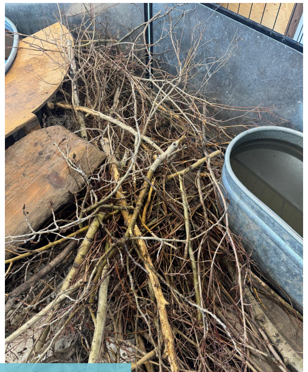
Beaver kit's lodge in indoor enclosure