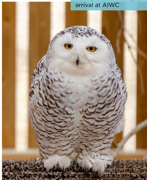
Snowy owl, not long after arrival at AIWC

To give her the best chance at healing, we immediately started her on a strict regimen of cage rest, antibiotics, and multiple pain medications. Her wounds were sutured and managed with bandages that were changed every other day. Because she wasn't yet eating on her own, our dedicated staff began tweezers feeding her twice a day to ensure she maintained her strength.