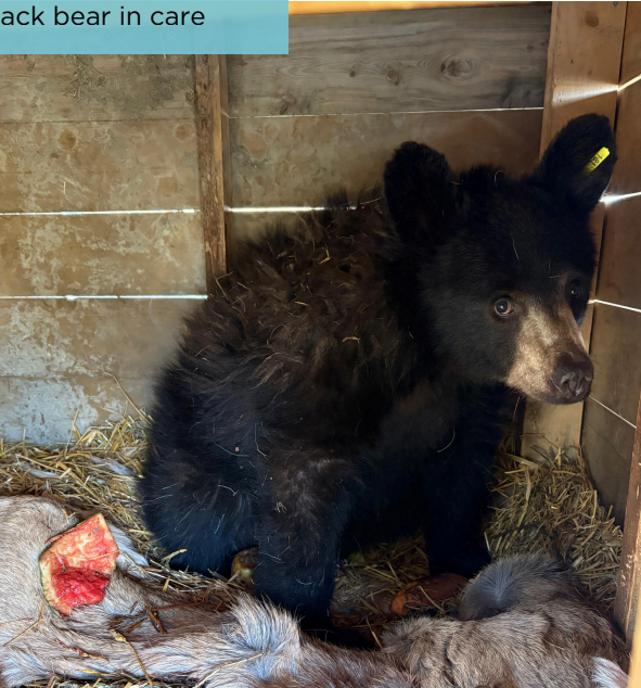
Black bear in care

In January, a roughly one-year-old black bear cub, weighing 12.5 kg (half the normal weight for his age), was found alone and attempting to den on a deck near Slave Lake.