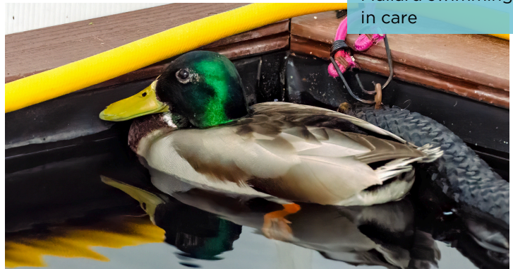
Mallard swimming in care

After a little over a month in our care, he was cleared by our veterinarian, with a healthy weight of 1.1 kg. On April 3rd, he was successfully released back into Calgary.