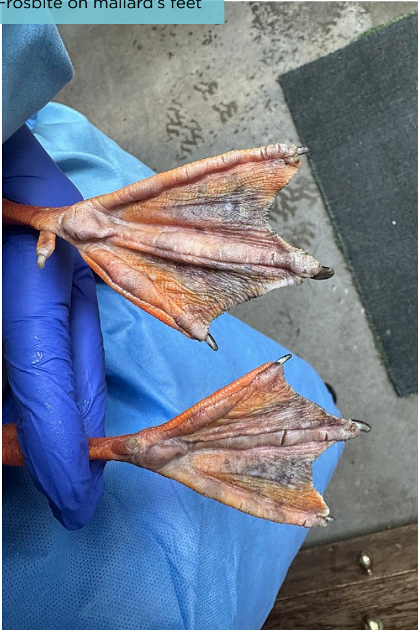
Frostbite on mallard's feet

When he was admitted, he was only 750 g (an average mallard weight is 1.0-1.3 kg), but fortunately, he started eating on his own right away. It was observed that he ate best when his favourite thing to eat, superworms, was on the water, so staff made him a special floating dish to eat from. His missing tail feathers didn't affect his waterproofing, and even though he came in with some minor waterproofing issues, he was able to heal on his own. He had pool access most of the time he was in care.